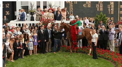
The 2011 Kentucky Derby winner's circle