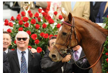
Derby Winner's Circle