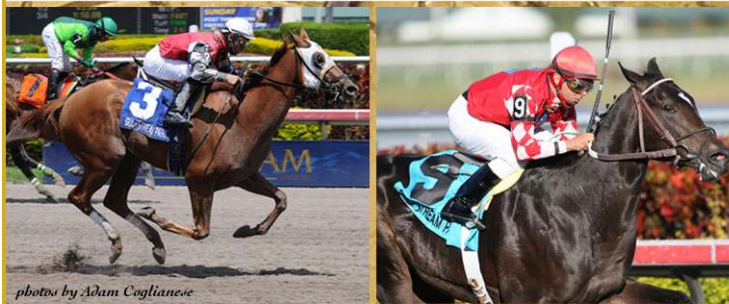
Close It Out (left) and Determinato each won stakes during Gulfstream's 2011 meet

A leading first and second crop sire, CLOSING ARGUMENT is making the case again in 2011. With 20 winners this year, including Gulfstream Park stakes winners Close It Out and Determinato, CLOSING ARGUMENT is the right choice for your mare.