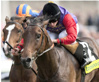
Carlton House

Victory in the Epsom Derby has so far eluded The Queen, but 2011 could mark a watershed year if Carlton House (Street Cry {Ire}) can build on yesterday's smooth success in York's G2 Dante S. Sent off at 11-4 for the Blue Riband's premier trial, the