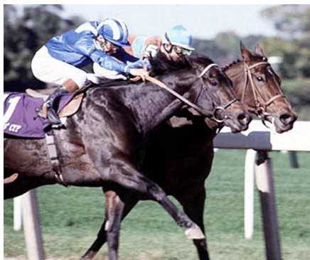
Safely Kept (inside)