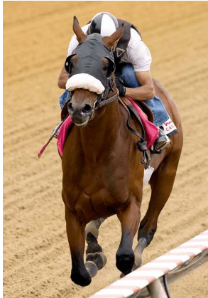
Norman Asbjornson