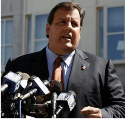
Gov. Christie