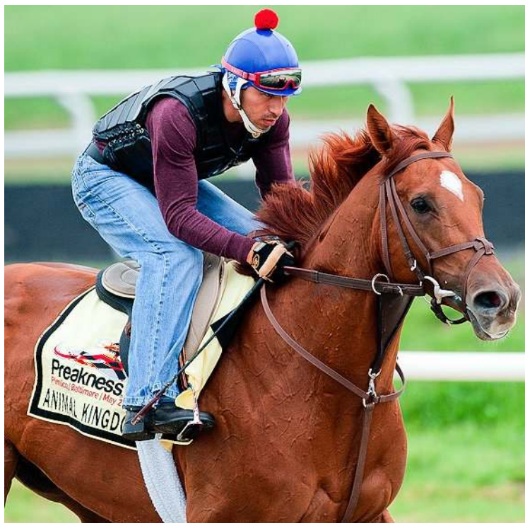
Animal Kingdom gallops Monday