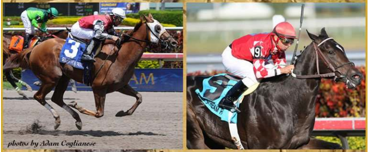
Close It Out (left) and Determinato each won stakes during Gulfstream's 2011 meet

A leading first and second crop sire, CLOSING ARGUMENT is making the case again in 2011. With 20 winners this year, including Gulfstream Park stakes winners Close It Out and Determinato, CLOSING ARGUMENT is the right choice for your mare.