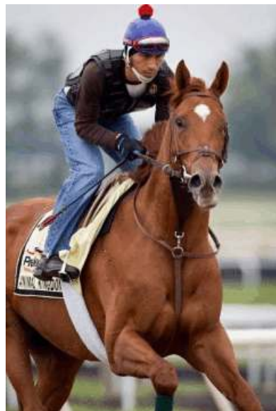
Animal Kingdom

While 11 of the 14 sophomores entered for today's GI Preakness S. at Old Hilltop have shipped in from Kentucky (8) and New York (3), Team Valor International's Animal Kingdom (Leroidesanimaux {Brz}) has been basking in the afterglow of his victory in the GI Kentucky Derby in the comparatively serene surroundings of his home base at the Fair Hill Training