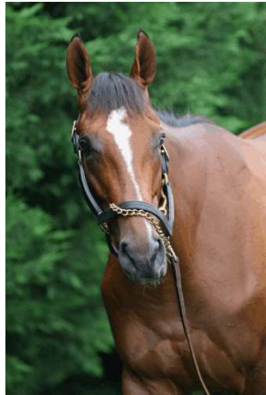
Mucho Macho Man

Only longshot Isn't He Perfect (Plesantly Perfect) has made more trips to the races than Mucho Macho Man (Macho Uno), who will be making his 10th career appearance and fifth of the season. A maiden winner and twice Grade II-placed at two, the bay colt has held