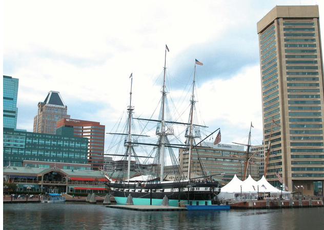
Baltimore's Inner Harbor