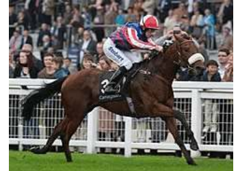
Dubawi Gold