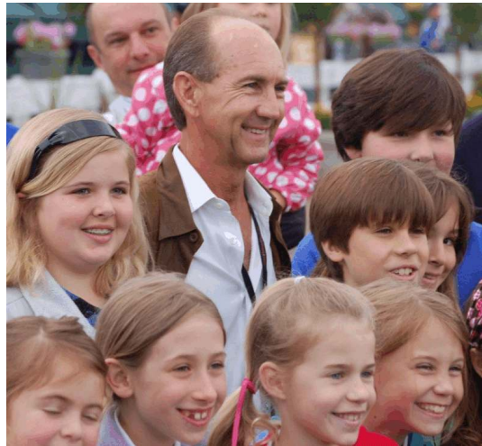
Hall of Fame jockey Jerry Bailey & friends