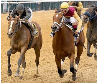
R Holiday Mood (right)

Third in the slop at Aqueduct Dec. 12 in her only start at two, R Holiday Mood came back to break her maiden going a mile on the inner track Feb. 12, and added a neck tally in the Out Ruled S. over that track Mar. 13.