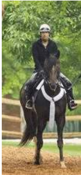
Dialed In