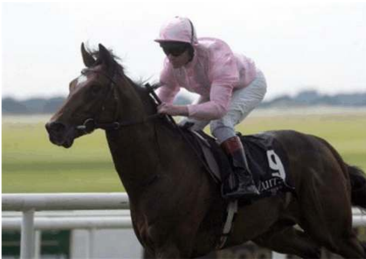
Roderic O’Connor