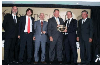
Connections of Lingote de Oro Hipodromo de San Isidro

HORSE OF THE YEAR Keyser Soze Stud's Lingote de Oro (Arg) (Orpen--Laika, by Old Trieste) took home the lion's share of the awards at this week's Carlos Pellegrini Awards, including honors as Argentina's Horse of the Year, as well as the recognition as the country's champion stayer and champion older horse. His American-bred dam Laika was elected champion broodmare, and Orpen was named champion