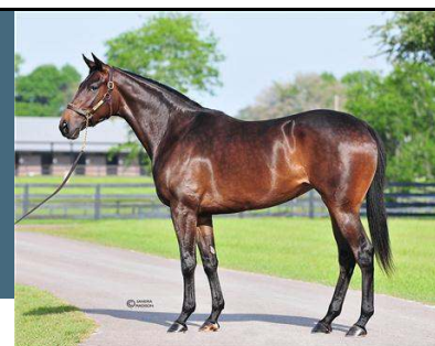
HIP 252 - Filly