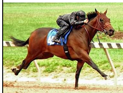
HIP 451 - Filly

Street Sense/Polish Nana Co-fastest work at the Under Tack Show in 10.1