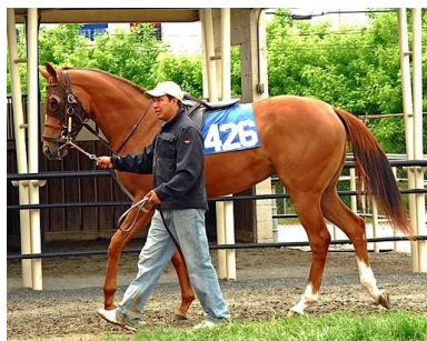
HIP 426 - Filly

Medaglia d'Oro/Ada's Dream Worked in 10.3