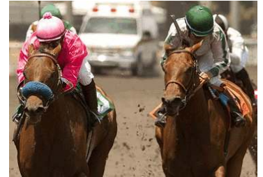
Ultra Blend (left) and St Trinians