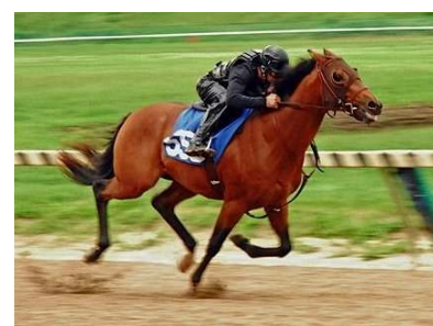
HIP 558 - Colt

Discreet Cat/Clever Empress (GB) Worked in 10.3