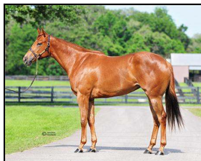
HIP 109 - Filly

Badge of Silver/Jasmine and Jewels Co-fastest work at the Under Tack Show in 10.1