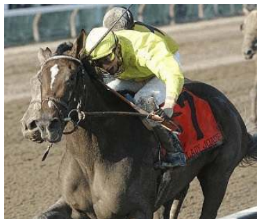
Lady Joanne