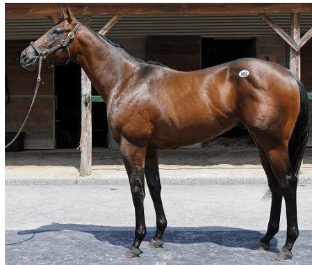
Hip 492