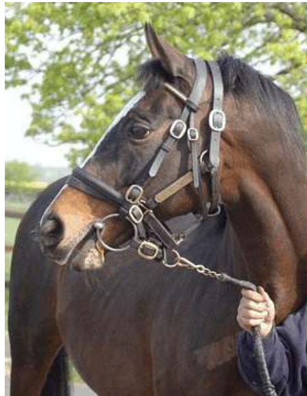
Mtoto (1983-2011)

Mtoto (GB) (Busted {GB}--Amazer {Fr}, by Mincio {Fr}) died at his home Aston Uphorpe Stud at the age of 28. Retired to Darley's establishment at the end of his stellar racing career in 1989, the triple Group 1 scorer went on to sire the likes of Presenting (GB),