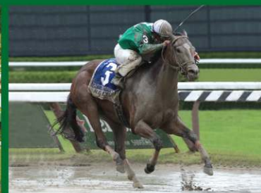
G1W CAPT. CANDYMAN CAN