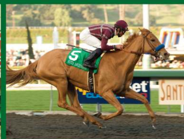
G1W EVITA ARGENTINA