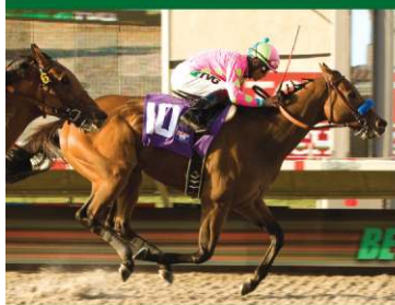
G1W EL BRUJO