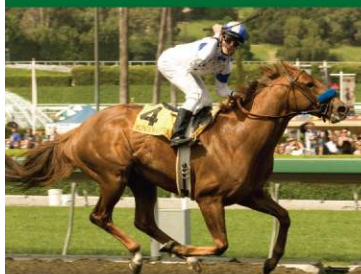
G1W SIDNEY'S CANDY