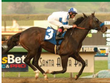
G1W TWIRLING CANDY (will stand at Lane's End)

SIRE OF 6 GRADE 1 WINNERS FROM HIS FIRST TWO CROPS TO RACE: