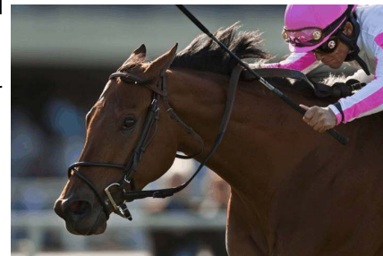
Dubawi Heights (GB)