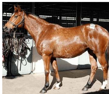
Arapaho Miss

MONDAY She only won twice in her 26-race career, but Arapaho Miss (Aus) (Danehill Dancer {Ire}--Happy Heart {Fr}, by Exit to Nowhere) got it done when it