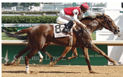
Sassy Image (#8)

Taking advantage of blazing early splits, Churchill ace Sassy Image, fresh off her upset victory in the GI Humana Distaff on Kentucky Derby day, closed resolutely under the Twin Spires and just nipped a