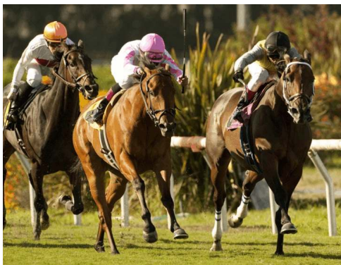
Dubawi Heights (GB) (Inside)

Dubawi Heights offered a glimpse of things to come when third in the 2009 G2 Lowther S. at York, and later that fall, finished a solid second behind Lillie Langtry (Ire) (Danehill Dancer {Ire})--a subsequent dual