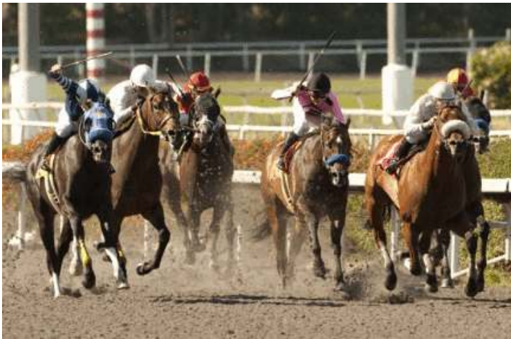
Camp Victory (blue & black silks, outside)