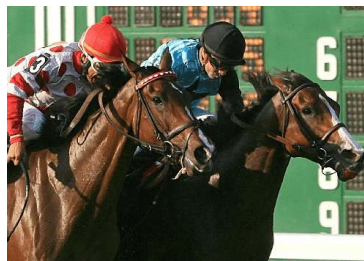
Denomination (inside)

Denomination, a Group 3 winner in France as a 3-year-old, won once in four 2010 efforts, a Tampa Bay optional-claiming victory that wrapped up her season in December. She ran Silver Reunion (Harlan's Holiday) to 1 3/4 lengths when third in the GIII Endeavor S. at Tampa Bay Feb. 12, then doubled her group/graded