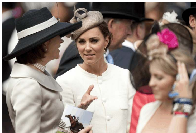
Kate Middleton (center)