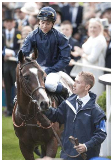
Pour Moi