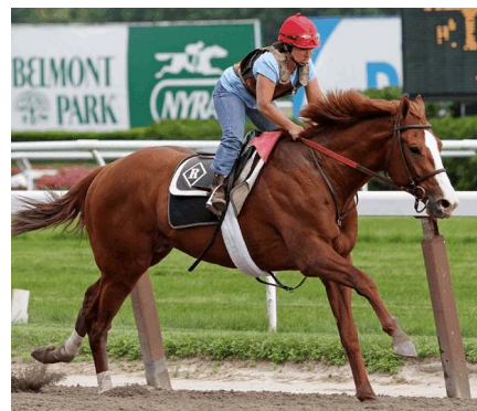
Shackleford & Fox