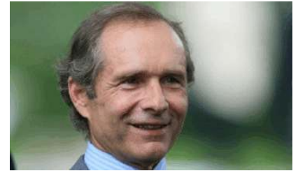
Andre Fabre

Flown over to experience the Downs at the "Breakfast With the Stars" gathering last Thursday, the bay exhibited his impressive acceleration once again to the waiting media.