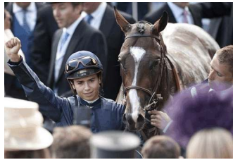
Pour Moi

Next in the sequence came Pour Moi, whose startling last-to-first effort provided Montjeu with his third winner of the Epsom Derby in the space of seven years. Those seven years have also seen three other Montjeu colts win the Irish Derby and another two win the Grand Prix de Paris (many people's idea of France's true equivalent to the Derby). Consequently, Montjeu has