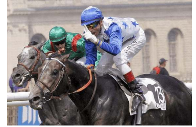
Reliable Man takes French Classic