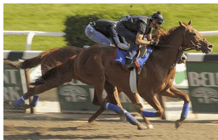
Animal Kingdom (outside)

GI Kentucky Derby hero Animal Kingdom (Leroidesanimaux {Brz}) had his final prep for Saturday's GI Belmont S. yesterday morning, going an effortless half in a bullet :47.76 as he tried out the main