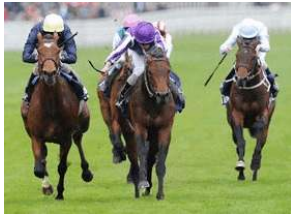
Treasure Beach (purple cap)

Perhaps we shouldn't be too surprised at this, as Sadler's Wells and Darshaan have become almost inextricably linked in the middle-distance sector of European Classic breeding. Sadler's Wells appeared in the pedigrees of eight of the 13 runners in the Derby, while Darshaan appeared in the pedigrees of seven. The two appear together in the pedigrees of five of the colts, including two of the race's other main players-- the gallant runner-up Treasure