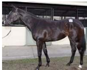
Lot 2011 Magic Millions

A daughter of More Than Ready out of MGSW and MG1SP Lady Mulan (NZ) (Bigstone {Ire}) became the Magic Millions National Yearling Sale topper yesterday when selling for A$190,000 (US$203,893) on day two