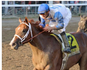
Dublin

Dublin (Afleet Alex), winner of the 2009 GI Three Chimneys Hopeful S., worked five furlongs yesterday at Churchill Downs in 1:00.20. The chestnut colt has been sidelined since running fifth in last year's GI Preakness S. and makes his return to the races in Friday's Kelly's Landing S. at Churchill.