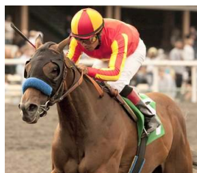
Irish Gypsy Benoit

Margins: 1 1/4, HF, 1 1/4. Odds: 1.30, 4.00, 4.60. Irish Gypsy made only one start last term, running second in Sacramento's California State Fair Sprint H. last July. She resurfaced with a runner-up effort at this track in the May 1 Time to Luv S. and closed late to get her head in front in the May 30 Valid Expectations S. at