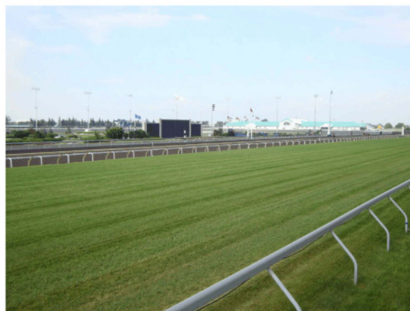
View of E.P. Taylor Course from tent patio CBoss