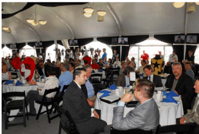
Draw Breakfast Crowd