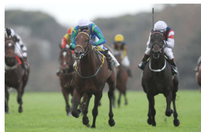
Suggestive Boy (center)

of class," said the rider. "He made the trip without any kind of problems and, in the stretch, finished in a great form. Undoubtedly, he is one of the best horses I have ridden."