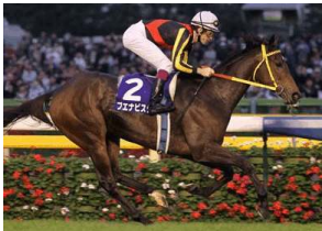
Buena Vista Japan Racing