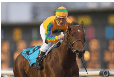
Star Runner Marcelo Sarachi/Turf Diario

victory in the 2000-meter G1 Gran Premio Estrellas Classic, crown jewel of the XXI edition of the Carreras de las Estrellas at San Isidro Racecourse in Argentina. The Classic, which like every other race on the card was contested over very soft turf, saw 5-year-old Star Runner sit two or three