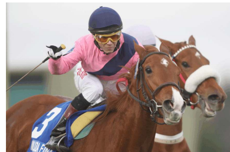
Gamuza Fina (#3)