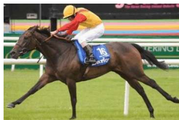
Snow Fairy