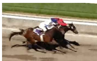
Hollywood Wildcat (rail) winning the '93 BC Distaff