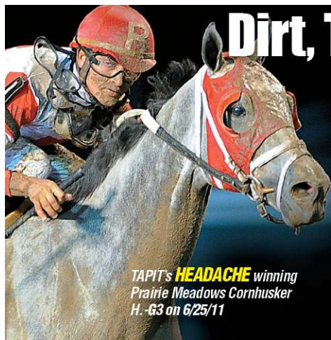
TAPIT's HEADACHE winning Prairie Meadows Cornhusker H.-G3 on 6/25/11