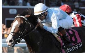
Courageous Cat