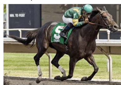
Four Footed Fotos

Devil By Design failed to hit the board in her last three appearances of 2010, and hadn't been out since fading to ninth in the GII Chilukki S. at Churchill Downs Nov. 6, but she was a different proposition in her 2011