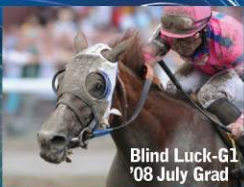
Blind Luck-G1 '08 July Grad