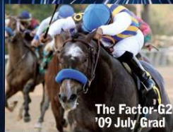
The Factor-G2 '09 July Grad