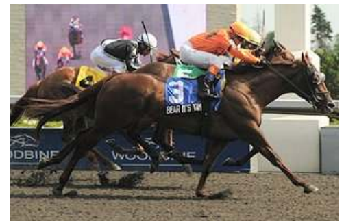
Bear It's Time

Bear It's Time graduated second time out by 6 1/4 lengths last December and returned to add a 5 1/4-length victory in the May 23 Lady Angela S. Trying a route for the first time, the chestnut filly tired to sixth behind Inglorious (Hennessy) in the June 5 Woodbine Oaks last time out. Held in abeyance in the early going, the filly spurted into contention when asked for run turning for home, sputtered slightly