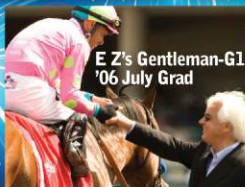
E Z's Gentleman-G1 '06 July Grad