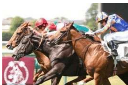
Mutual Trust (Center)

Sticking close to the restrained early leader Strong Suit,