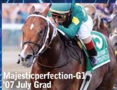
Majesticperfection-G1 '07 July Grad