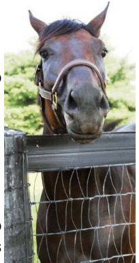
Uncle Mo at WinStar

Repole Stable's champion Uncle Mo (Indian Charlie), who has been recuperating from a liver disorder at WinStar Farm in Kentucky, is expected to rejoin trainer Todd Pletcher's New York string next week, Daily Racing Form reported. Pletcher told the publication that the colt's progress has been "excellent so far." The 3-year-old is slated to ship to Saratoga Monday, along with stablemate R Heat Lightning (Trippi), who was forced to miss the GI Kentucky Oaks with a knee chip. Uncle Mo's Facebook page has several videos of the colt training, including this one of him galloping.