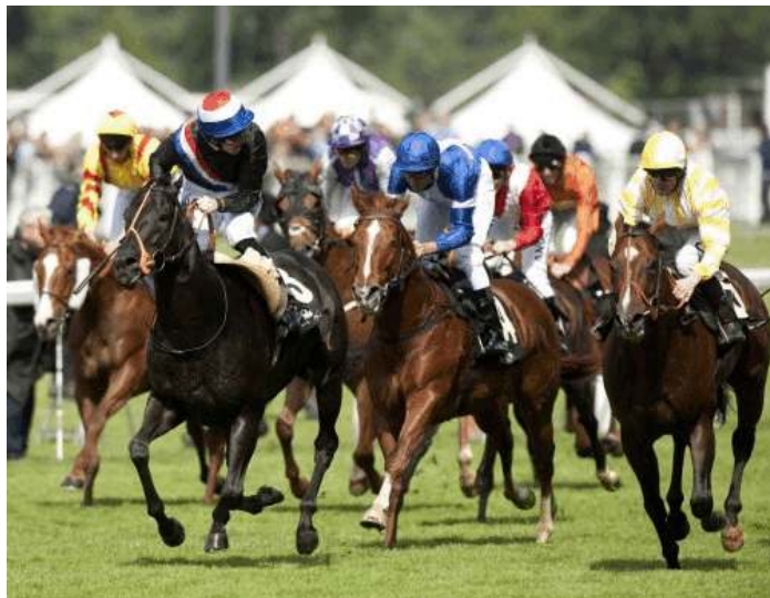
Star Witness (blue cap, center) finishing third in the G1 Golden Jubilee S. at Royal Ascot

Of how his charge has been doing since Royal Ascot, O'Brien offered, "He went into the King's Stand S. needing the run--it was part of his preparation for the Jubilee--but we were still hoping to win that race. He came out of the King's Stand S. in great order and obviously ran very well on the Saturday without conditions being in his favour."