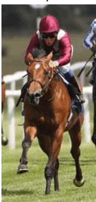
Shumoos winning at Haydock