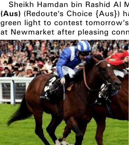
Elzaam (Aus)

Sheikh Hamdan bin Rashid Al Maktoum's Elzaam (Aus) (Redoute's Choice {Aus}) has been given the green light to contest tomorrow's G1 Darley July Cup at Newmarket after pleasing connections in his recent work. Fourth in the G1 Golden Jubilee S. on soft ground at Royal Ascot last time June 18, the Southern Hemisphere-bred had previously registered an impressive six-length win in Listed Carnarvon S. over this trip at Newbury May 13. That effort followed two seven-furlong outings when