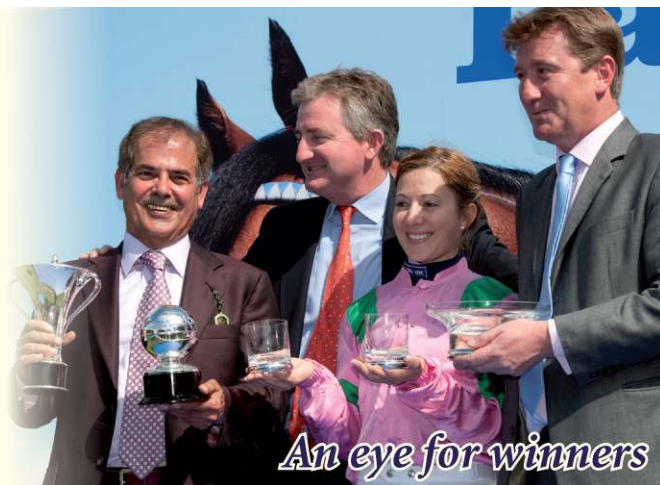
An eye for winners

DREAM AHEAD was purchased at the Doncaster Breeze-Up Sale for £36,000 from Tally-Ho Stud.