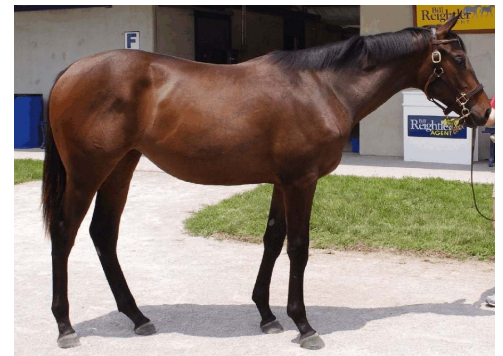
Hip 131, f, Midnight Lute--Sweet Breanna