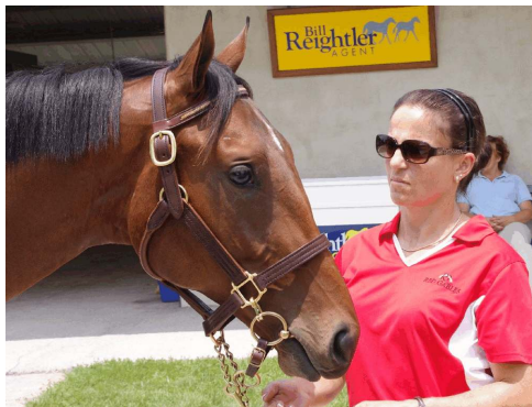
Johnson & Hip 191, c, Notional

The pinhooked yearling is hip 191 , a colt from the first crop of Grade II winner Notional (In Excess {Ire}).