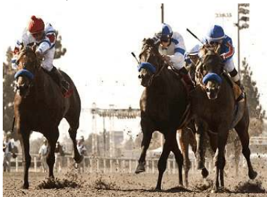
First Dude (left) over Game On Dude (far right)

Game On Dude (Awesome Again) led for 9.999 of the 10 furlongs in the G1 Hollywood Gold Cup, but he came up about an inch short as stablemate First Dude (Stephen Got Even) nailed him on the wire at Hollywood Park Saturday. Cont. p2