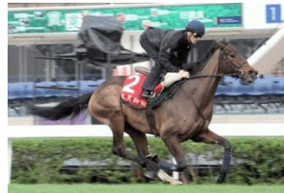
Cirrus des Aigles in Hong Kong

No worse than third in any of his five previous trips to the post, Cirrus des Aigles (Fr) (Even Top {Ire}) grabbed the lead a quarter mile from home and charged away to a popular and comfortable victory in the G3 Grand Prix de Vichy Wednesday evening. Third in Longchamp's G1 Prix Ganay Apr. 30, the gelding hustled