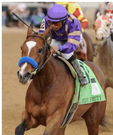
Plum Pretty

Five graded stakes winners, including the horses who emerged victorious from the GI Kentucky Oaks, GI Acorn S. and GI Mother Goose S., were entered for the Saturday feature at Saratoga, the 95th running of the GI TVG Coaching Club American Oaks. Peachtree Stable's Plum Pretty (Medaglia d'Oro) looks to become