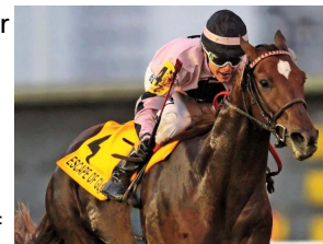
Escape of Glory