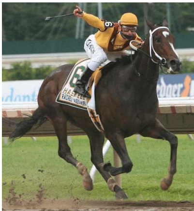
Rachel Alexandra (Medaglia d'Oro) makes history in the 2009 Haskell defeating the boys by six lengths