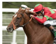
Strong Suit (Rahy) (left) strikes in G2 Lennox S. at Glorious Goodwood.....p5-6

G3 Gordon S. - Namibian (Ire) (Cape Cross {Ire}) - p6 G3 Molecomb S. - Requito (Ire) (Dansili {GB}) - p7