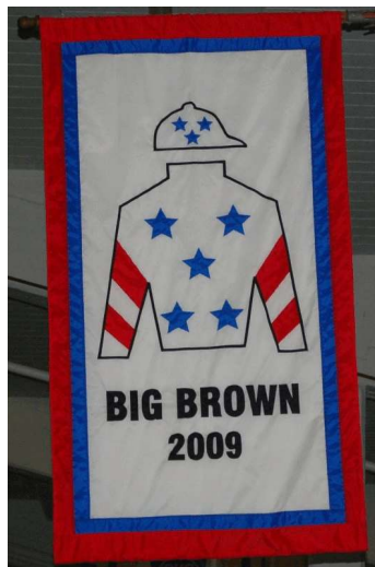
Dual Classic winner Big Brown (Boundary) annexed his fourth career Grade I in the 2008 Haskell