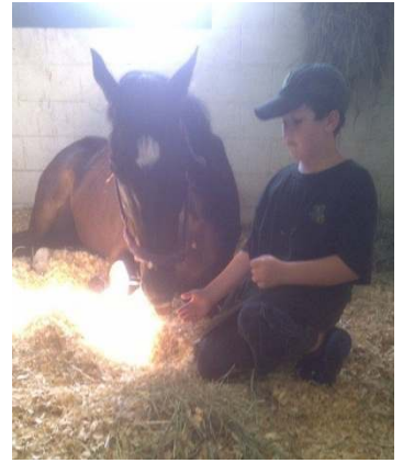
Byanosejoe rests with a friend after his journey home

It had been a long time since any of us had thought or heard of Byanosejoe, yet almost everybody connected with this horse during his racing career has been happy to make a donation to his cause. For the few critics out there who subscribe to the perception that the Thoroughbred industry doesn't care about its "older generation," this is one of the many stories that proves otherwise. This is a story where the passion and love of the animal has prevailed. Byanosejoe just won his most important race--for his life.