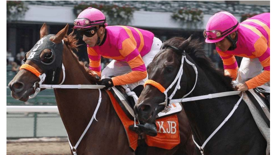
Ruler on Ice (Roman Ruler) and Pants on Fire (Jump Start) work in company between races at Monmouth Park Sunday