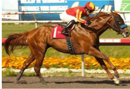
Coil, a son of 2001 Haskell hero Point Given, heads east for Bob Baffert following a second-place finish in Hollywood's GI Swaps S.