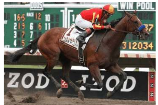
Lookin at Lucky (Smart Strike) puts an exclamation point on a championship season with a dominating win in the 2010 Haskell Equi-Photo