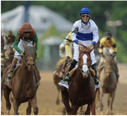
Shackleford (Forestry) wins the 2011 GI Preakness S.