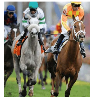
More Than Real bests Winter Memories (green cap) at Churchill