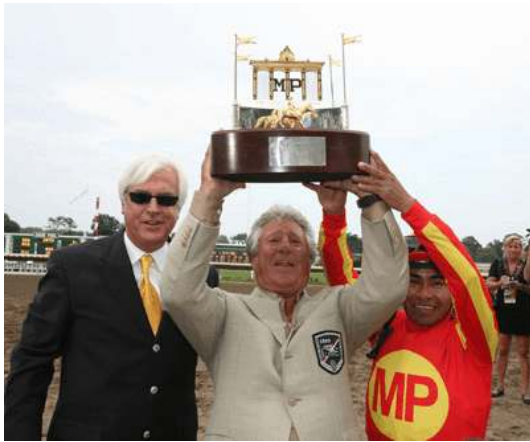
Hall of Fame trainer Bob Baffert has won the Haskell a record four times