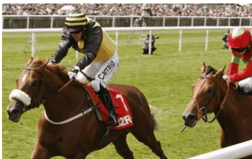
Red Duke defeats Chandlery www.dbsauctions.com

The finish line for mare registration is approaching fast.