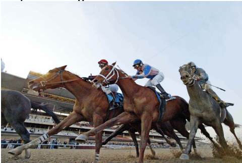
Byanosejoe (right) finishes fifth in the 2005 Gotham S.