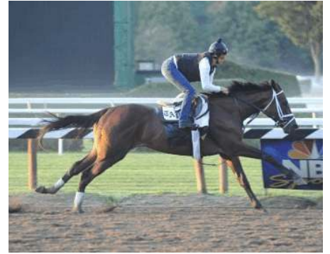
Uncle Mo

was under little urging to gallop out five-eighths in 1:03. "It's a steady progression," trainer Todd Pletcher commented. "We stepped it up to a half today, and I particularly like the way he galloped out. His fitness level is more than what I thought it would be." It was the second work for Uncle Mo, who was forced to miss the Triple Crown after being diagnosed with a liver disorder. In his most recent start, he was handed the first defeat of his career when finishing third in the G1 Wood Memorial in April.