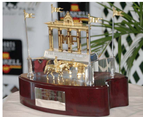
Haskell Trophy on display at Thursday's draw

Belmont S. winner Ruler On Ice will be joined by stablemate Pants on Fire (Jump Start), who has been assigned post three. The dark bay sandwiched a ninth-