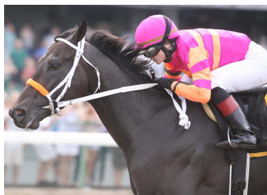
Pants on Fire