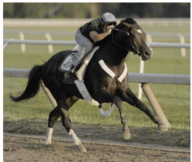
Morning Line Works over Saratoga's Training Track Thursday