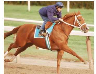
Keeneland Kat