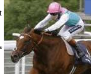
Frankel (GB)