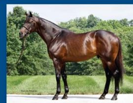
By Seeking the Gold

2YO filly MARIN'S MAGIC led at every call at Monmouth on 7/25 to become the third winner for her sire.