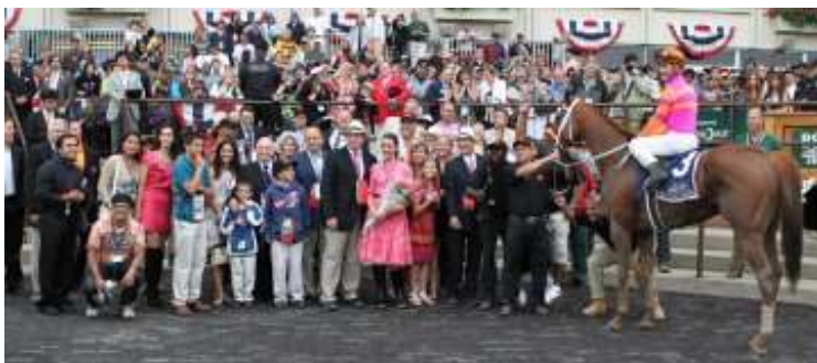
Belmont Stakes Winner's Circle