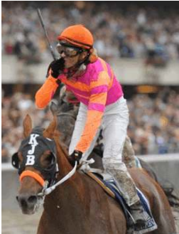
Ruler On Ice