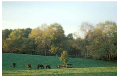
Brookdale Farm www.brookdalefarm.com