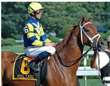
Pool Land www.brookdalefarm.com

Brookdale started off on the right foot with its initial foal crop in 1984, which totaled 24 and included