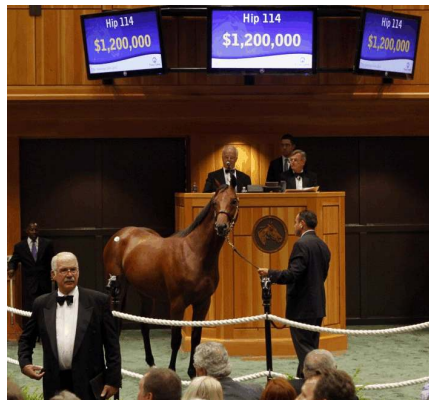
Hip 114 tops Tuesday's session