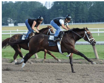
Uncle Mo