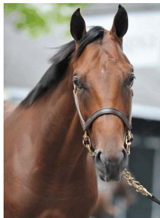
Hip 114 checking out the scenery