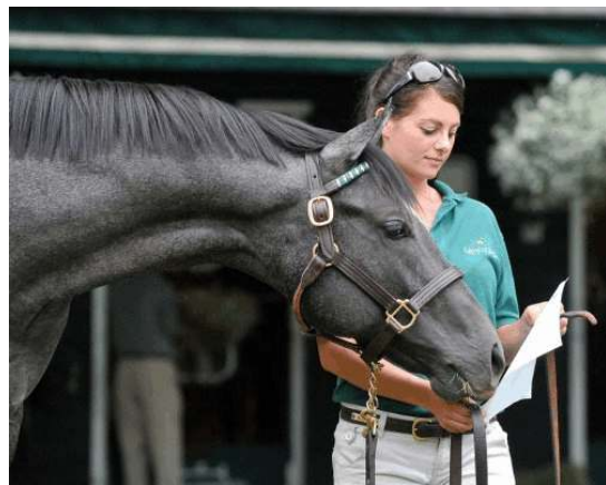
Hip 111 - Unbridled's Song colt

Campaigned by Kinsman Farm, 14-year-old Dream Supreme won six graded stakes during three seasons on the track, including the GI Ballerina H. and GI Test S. The millionairess, out of Grade I winner Spinning Round (Dixieland Band), has been equally successful in the breeding shed, producing GI Hopeful S. hero Majestic