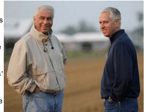
Lukas & Pletcher

It could be said the fairer set was the flame that fueled Team Lukas, however, it was the men who held ranks under Lukas that served as the kindle. Very few Thoroughbred trainers have been as closely identified with the people who have emerged from their camps as has Lukas and his former assistants. Giving credit where credit is due, he is the first to applaud his former students' ability, discipline and dedication, all of which lent to the stable's success.