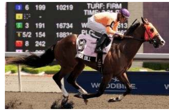
Banner Bill