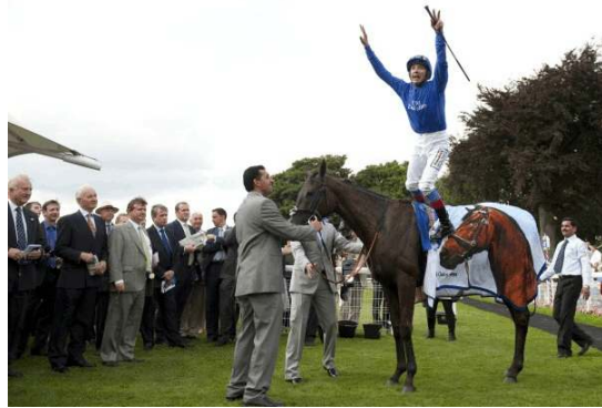
Dettori Performs his Famous Flying Dismount from Blue Bunting

Few fillies are able to win Classics over a mile and a mile and a half, but of the recent members of that sex to do so it is interesting to note that two were representatives of Sheikh Mohammed bin Rashid Al Maktoum. Both his homebred Oh So Sharp (GB) and German acquisition Kazzia (Ger) (Zinaad {GB}) managed