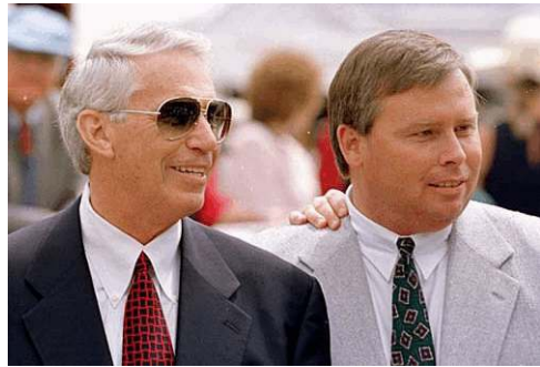
Wayne & Jeff Lukas Horsephotos

With at least one likely future Hall of Famer looming among the Lukas alums, the conditioner pointed to a former assistant that, in his opinion, would have surely been destined for the great Hall, had fate not intervened.