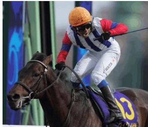
Victoire Pisa

G1 Dubai World Cup winner Victoire Pisa (Jpn) (Neo Universe {Jpn}) has suffered a setback while training in France and will be forced to miss the Oct. 2 G1 Prix de l'Arc de Triomphe. "On Aug. 13 after training, they noticed that the movement in his left leg was a bit restricted and a vet discovered it was inflamed and that the horse should take it easy for five weeks," according to a statement from the Japan Racing Association. Seventh in last year's Arc, the 4-year-old has not started since his emotional win in the World Cup in March. He was forced out of the May 1 G1 Audemars Piguet Queen Elizabeth II Cup with a slight injury to his right hind leg.