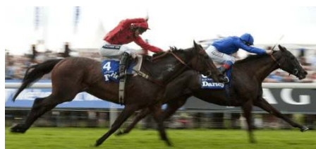
Blue Bunting Holds off Vita Nova

A latecomer in both the May 1 G1 1000 Guineas at Newmarket and G1 Irish Oaks at The Curragh July 17, Godolphin's Blue Bunting (Dynaformer) proved that she can also tough it after making a late lead in a thrilling