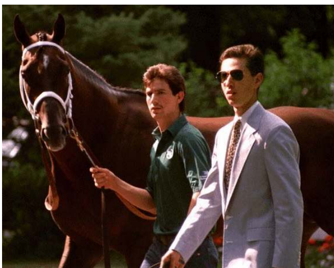
Horse of the Year Criminal Type & Todd Pletcher in 1990

“I like to think that I imparted something of value to those young men,” he said. “Having said that, I think those guys [former assistants] were going to be successful if they had never met me, but maybe I pushed them along a little quicker. It was the appearance of the barn and the horses, a lot of the little things that go unnoticed, that helped make a difference. But I also tried to change those kids' lives. I still love them, I really do. It's just the coach in me, I guess.”