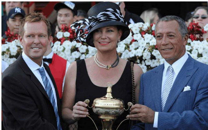
The GI Alabama S. Trophy Presentation