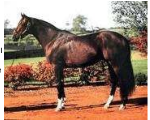
Saratoga Six tv.com

"Grand Canyon was just a beautiful horse," said Lukas. "I had Criminal Type [Horse of the Year in 1990] run in an allowance race at Hollywood Park--he won going a mile in 1:34 3/5. The next race was the [GI] Hollywood Futurity and Grand Canyon ran in 1:33 flat. He was just unbelievable."