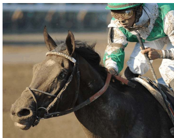
Royal Delta

Palides Investments homebred Royal Delta (Empire Maker), a well-beaten third behind It's Tricky (Mineshaft) and Plum Pretty (Medaglia d'Oro) in the