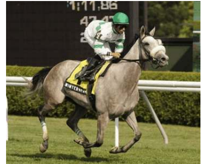
Winter Memories