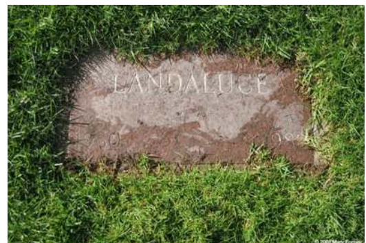
Landaluce Memorial at Hollywood Park

"You search and you look, and then all of a sudden, it comes, that star, and you know you have been blessed with something special."