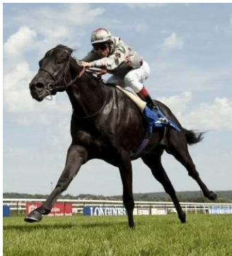
Dabirsim (Fr)