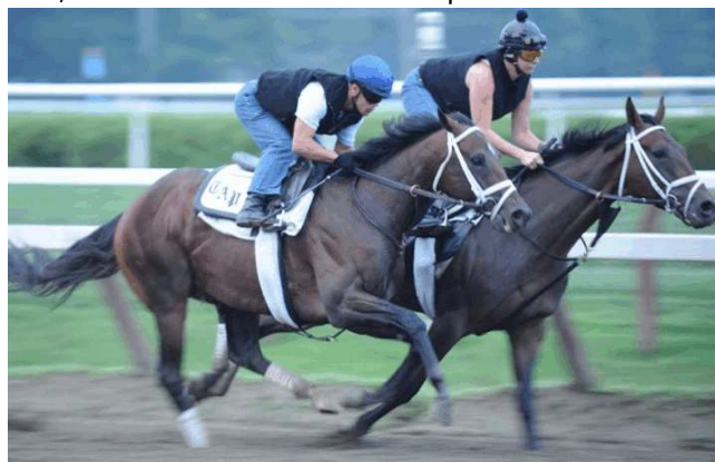
Stay Thirsty (outside); Super Espresso (rail)