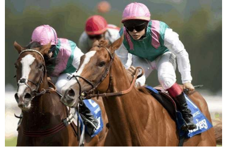
Announce (GB)