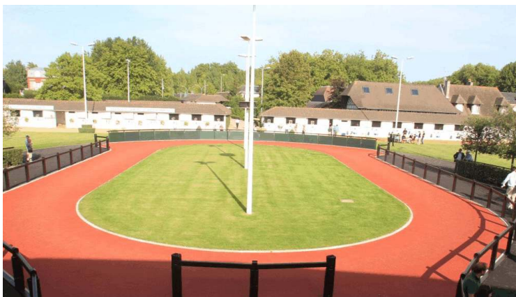
Arqana Parade Ring

We can say that this renovation is a major success and has been extremely well-received. It is a major tool in our development.