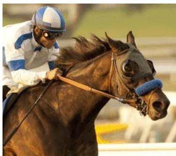
Twirling Candy