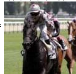
Darbirism (Fr)