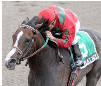
Flat Out

earned a field-best 113 Beyer when taking the nine-panel GII Suburban H. by 6 1/2 lengths at Belmont Park July 2, and followed up with a second-place effort in the GI Whitney H. Aug. 6 that earned him a 106. He may have been compromised by slow fractions of :49 and 1:13 4/5 in his