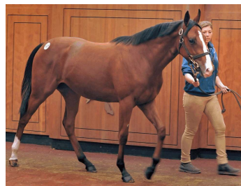
Lot 165