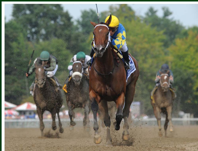
Hilda's Passion dominates the GI Ballerina by nearly 10 lengths.