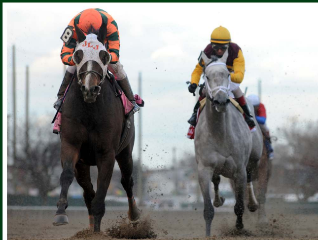
No Such Word easily takes the GI Gazelle H. in her career finale.

Now 2 Grade I winners from a 2nd crop of 45 registered foals