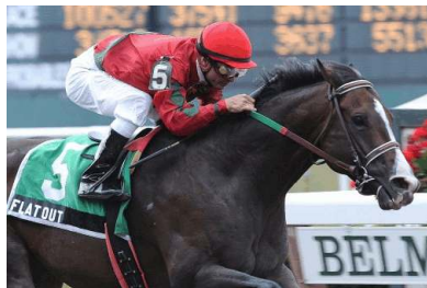
Flat Out at Belmont