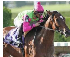
Mambo Meister