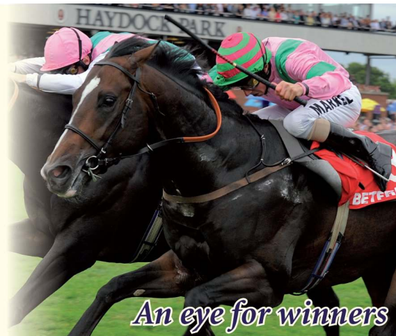
An eye for winners

DREAM AHEAD was purchased at the Doncaster Breeze-Up Sale for £36,000 from Tally-Ho Stud, Ireland.