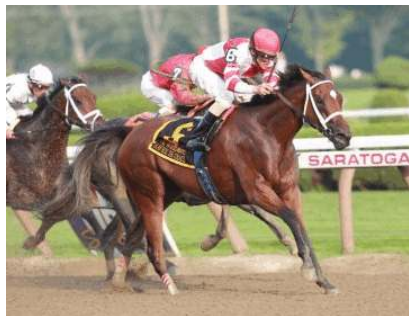
Havre de Grace front and center in the Woodward