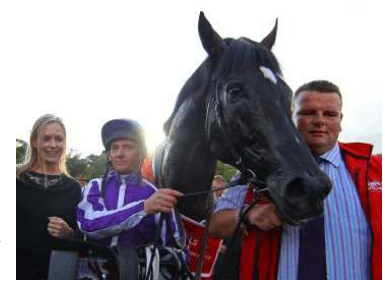
So You Think