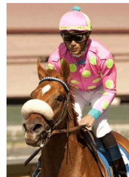
Andina