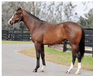
Currency Swap , from the DeMeric Sales Facebook page. DeMeric signed the ticket as a FTKJUL yearling for Klaravich and co.

Currency Swap earned a gaudy 98 Beyer when graduating by six lengths at first asking at Saratoga Aug. 6 ( video ). He leads the quartet of juveniles making their second starts off debut maiden scores.