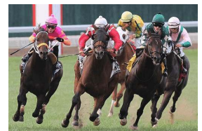
Yummy With Butter (white cap)