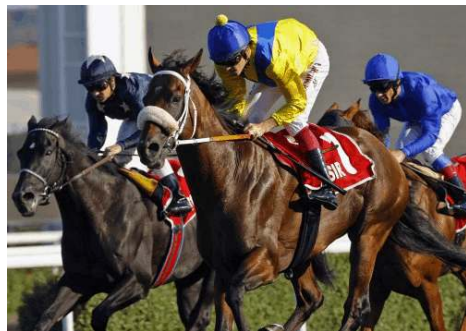
Musir (yellow silks)

Musir was the undoubted class act of this line-up, and was ultimately not hard-pressed to get back to winning ways following an intense period of top competition. Having booked a trip to Dubai when flaunting his ability in the 2009 G1 Golden Horseshoe at Greyville, the bay