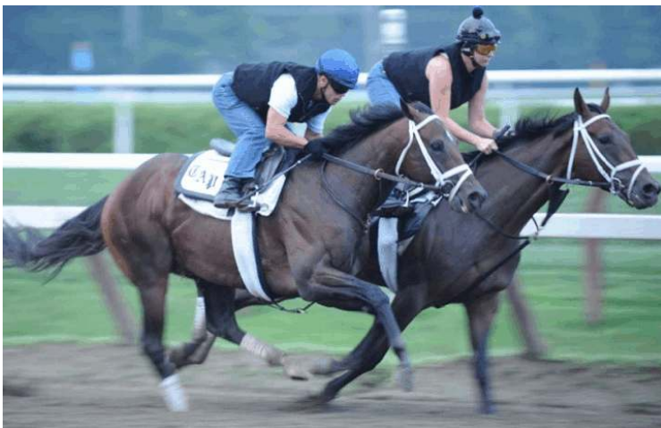
Stay Thirsty (outside) & Uncle Mo