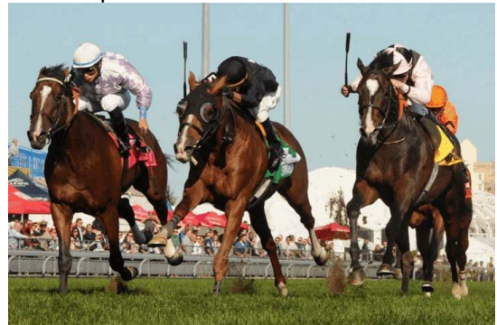
Wigmore Hall (Ire) (right)