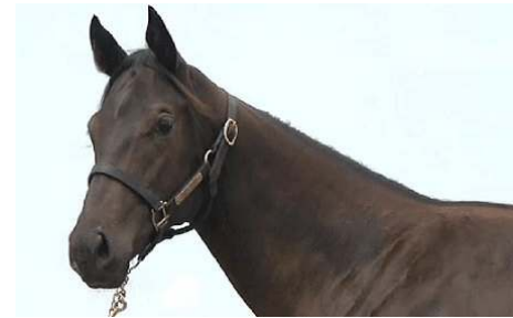
More Than Ready--Search and Seizure

The filly's dam hails from a good family cultivated by the Janney family. Search and Seizure's third dam is MGSW Wedding Party (Hoist the Flag), while her second dam is GSW Deputation (Deputy Minister), also the second dam of Stuart Janney III's GISW Carriage Trail (Giant's Causeway).