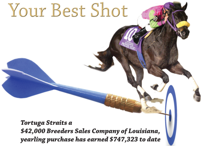
Tortuga Straits a $42,000 Breeders Sales Company of Louisiana, yearling purchase has earned $747,323 to date

Louisiana breeders have continually been upgrading their stock. Yearlings offered in this sale have top notch pedigrees. Plus the majority of yearlings here are Louisiana-bred with the extra advantage of purse supplements, and over $5.5 million in Louisiana-bred stakes races run in 2010 alone.