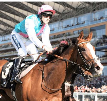
Timepiece (GB)