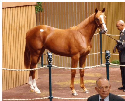
$110,000 Proud Citizen--In Return filly