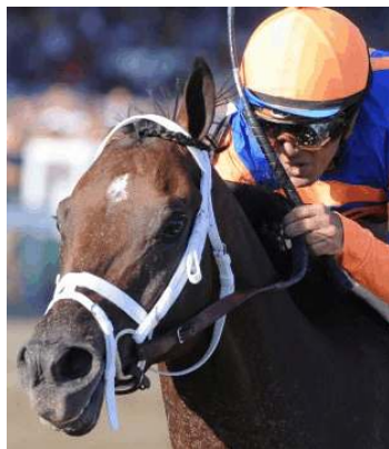
Stay Thirsty

GI Travers S. winner Stay Thirsty (Bernardini), prepping for the GI Jockey Club Gold Cup Invitational, went four furlongs in :47.07 on the Belmont training track Sunday. "Stay Thirsty is on a maintenance program," trainer Todd Pletcher remarked.