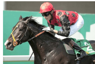
Dick Turpin