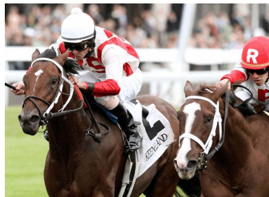
Animal Spirits (outside) & Coalport

Animal Spirits was making just his second career start in the Bourbon. He debuted at 8-1 odds going two turns over Saratoga's grass course Aug. 20 and ran with credit, rallying to get within a neck of winner and