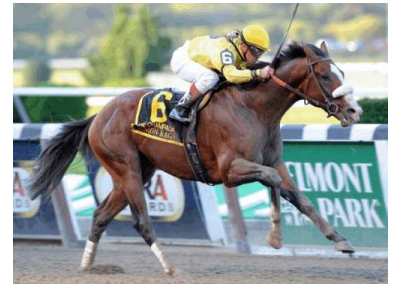
Union Rags