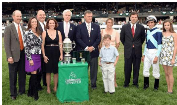
Spinster Trophy Presentation

Aruna followed the lead of her paternal siblings Crusade and Western Aristocrat to become the weekend's third winner at the top level for the late Gainesway stallion Mr. Greeley (Gone West), who was euthanized last November after complications from laminitis. Crusade took the G1 Middle Park S. at Newmarket, while Western Aristocrat upset the GI Jamaica H. at Belmont--both on Saturday.