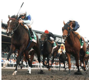
Aruna (left)

Flaxman Holding's Aruna (Mr. Greeley), rerouted to yesterday's GI Juddmonte Spinster S. at Keeneland after the turf for last Saturday's GI Flower Bowl