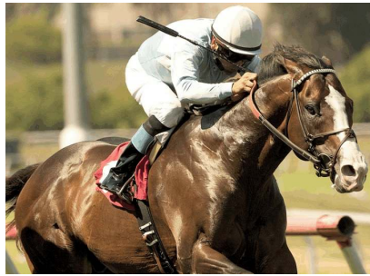
Courageous Cat