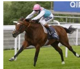
Frankel

While it is fair to say that the presence of So You Think (NZ) (High Chaparral {Ire}) was important for today's feature race, most eyes will be focused on the Ascot card's supporting act, the G1 Queen Elizabeth II S., which threatens to overshadow the main event thanks to one horse. Step forward Frankel (GB) (Galileo {Ire}) who, like Black Caviar (Aus) (Bel Esprit {Aus}) has taken the people back to the times of their respective country's racing greats. By now, the exploits of this zenith of the Juddmonte operation's decades of breeding expertise are well documented, and his stand-out performances in the Apr. 30 G1 2000 Guineas and July 27 G1 Sussex S. will live long in the memory. He has course form too, with a 10-length walk in the park in last year's G2 Royal Lodge S. to his name alongside his dramatic display in the June 14 G1 St James's Palace S., when Tom Queally daringly went full stretch before the final turn. Today's event over the straight course seems to represent easy pickings if he is able to reproduce his natural brilliance, and Sir Henry Cecil is hoping for a perfect end to a perfectly-crafted 3-year-old campaign. Cont. p4