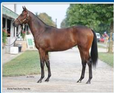
Bay Filly $220,000 KeeSep Purchase