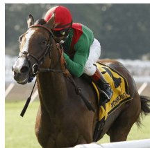
Summer Soiree Equi-Sport