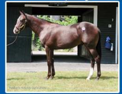
Bay Colt $165,000 F-T Saratoga Purchase