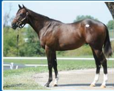
Dark Bay/Brown Colt $310,000 KeeSep Purchase