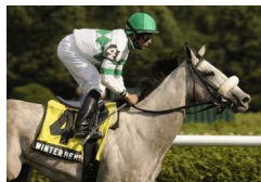
Winter Memories

Winter Memories' reputation among racing fans has ballooned to astronomical heights, most likely due to her desperate running style. The silver bullet lopes along in the early going, often getting herself into trouble, but