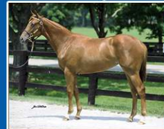
Chestnut Filly $100,000 F-T July Purchase