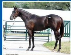
Dark Bay/Brown Colt $105,000 KeeSep Purchase