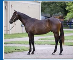
Dark Bay/Brown Colt $130,000 F-T July Purchase