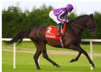
So You Think Racing Post

Eight Group 1 wins in the Southern and Northern Hemisphere have placed So You Think (NZ) (High Chaparral {Ire}) into a league of his own, and a crowning moment awaits him in today's G1 Qipco Champion S. at Ascot. Despite his successes in the July 2 G1 Eclipse S. at Sandown and G1 Irish Champion S. at Leopardstown Sept. 3, costly defeats in the G1 Prince of Wales's S. at the Royal meeting here June 15 and in the G1 Prix de l'Arc de Triomphe 13 days ago mean that he still has fans to win