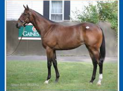
Bay Filly $190,000 F-T Saratoga Purchase