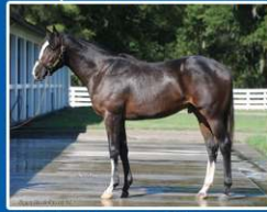
Dark Bay/Brown Colt $125,000 KeeSep Purchase