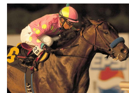
Midnight Interlude