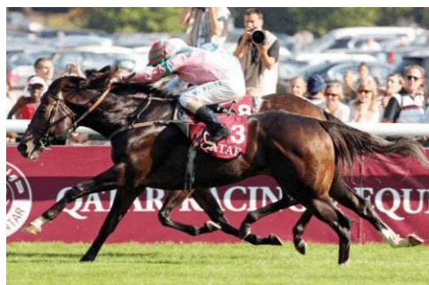
Dream Ahead defeating Goldikova in the G1 Prix de la Foret

Top European sprinter Dream Ahead (Diktat {GB}--Land of Dreams {GB}, by Cadeaux Genereux {GB}) had been under consideration for a tilt at the Breeders' Cup, but his connections have opted to retire him, and he will begin his breeding career in 2010 at Ballylinch Stud as previously announced. The Southern Hemisphere breeding rights to the 3-year-old were sold recently to Emirates Park Stud in New South Wales. Dream Ahead's stud fee has been set at €17,500 (£15,000),