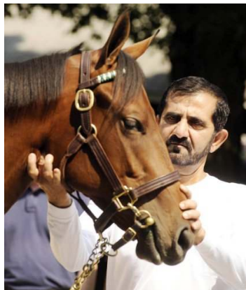
Sheikh Mohammed

Godolphin's Mandaeen (GB) (Manduro {Ger}) delivered on his abundant promise with an authoritative success in the G1 Criterium de Saint-Cloud Saturday.