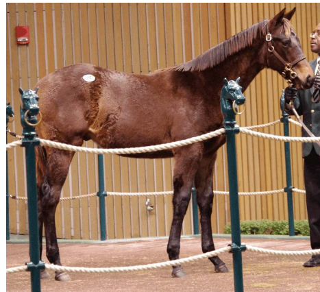
$250,000 Street Sense--Richbabe LM

through the ring, a Grand Slam mare, but could just as easily been talking about the horse that sold seven hips earlier, a strapping weanling colt by Street Sense that brought the day's highest bid. Hip 2050 , a colt from the third crop of the GI Kentucky Derby winner, was