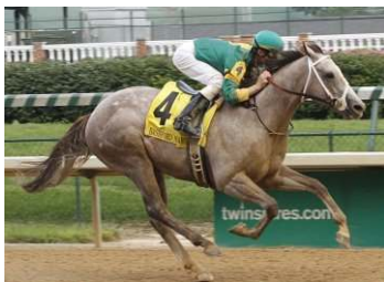
Exfactor

Stoneway Farm's Exfactor (Exchange Rate), off since annexing Churchill's GIII Bashford Manor S. July 2, continues to gear up for a return to the races, working