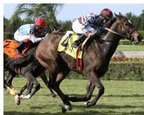
Italo