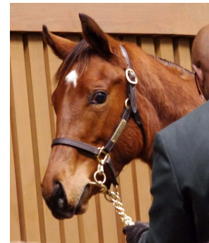
Hip 2016