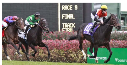
Marketing Mix in Command

Glen Hill Farm's Marketing Mix (Medaglia d'Oro), a strong second in the GI Queen Elizabeth II Challenge Cup S. at Keeneland Oct. 15, continues to take her game to new heights since switching to grass. The dark bay, heroine of Woodbine's Wonder Where S. July 31 and Arlington's GIII Pucker Up S. Sept. 17 on the green stuff, added another impressive victory to her resume in Saturday's