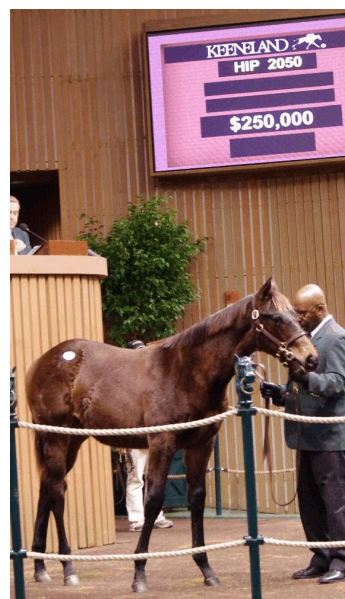
$250,000 Street Sense colt LM