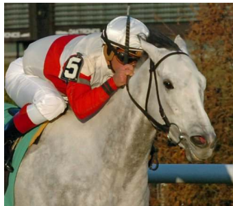
Hit It Rich

Hit It Rich held on for a wire-to-wire win in a grassy $50,000 optional claimer at Saratoga July 30, then reported home eighth in the Paris Opera S. at the upstate oval Sept. 3. Favored at 4-5 in an off-the-turf allowance at Keeneland Oct. 13, she drew clear to