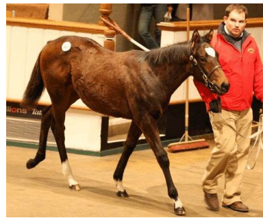
Lot 484 Tattersalls

An April-born son of Kyllachy (GB) (Pivotal {GB}) was the standout at Tattersalls Wednesday on the traditionally low-key opening session of the December Foal Sale. The colt was consigned from the Pocock