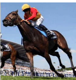
Snow Fairy

A total of 54 of the world's top turf horses, including 26 international Group/Grade I winners, have been extended invitations to the Cathay Pacific Hong Kong International Races to be staged Sunday, Dec. 11. With