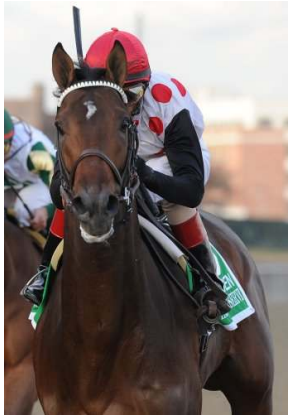
To Honor and Serve