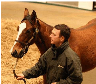
Lot 701 Tattersalls