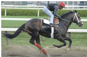
Flat Out

It's probably an understatement of major proportions to say that Flat Out hasn't shown much of an affinity for Churchill Downs. The 5-year-old's previous best at the Louisville oval was a fifth, recorded in his most recent start in the 10-furlong GI Breeders' Cup Classic Nov. 5. Earlier this season, the bay finished sixth in the nine-panel GI Stephen Foster H. June 18, but rebounded to romp in Belmont's GI Suburban H. July 2. Prior to the Breeders' Cup, he was runner-up in the GI Whitney H. and GI Woodward S. before defeating subsequent Classic winner Drosselmeyer in the Oct. 1 Jockey Club Gold Cup. West Coast trainer Bob Baffert is represented by the ultra consistent Prayer For Relief . In the money in all five starts this term, the dark bay reeled off four straight graded stakes victories, including the Aug. 6 GI West Virginia Derby and the GI Super Derby Sept. 10, both contested at this distance. Most recently, he came from just off the pace to be third, but should find the pace scenario much more to his liking this time. This year's race also features a Classic winner in GI Belmont S. winner Ruler On Ice . While unable to score since that victory, the chestnut has hit the board in three of four starts, including a third in his latest start in the Breeders' Cup Classic.