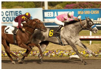
So Brilliant

The aptly named So Brilliant (Medaglia d'Oro) continued to live up to his name with a front-running victory in the GIII Hollywood Prevue S., Hollywood Park's Thanksgiving Day feature. Breaking slightly to the inside, the grey quickly strode up between Hodge (City Place) and Galex (Flatter) up the backstretch, before assuming a slight advantage through a quarter in :22.94. Passing the half-mile marker, Galex