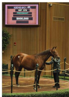
Dam of GSW SOLDAT, Le Relais sold for $800,000 in foal to BLAME.