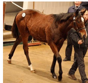
Day 2 Topper, Lot 667