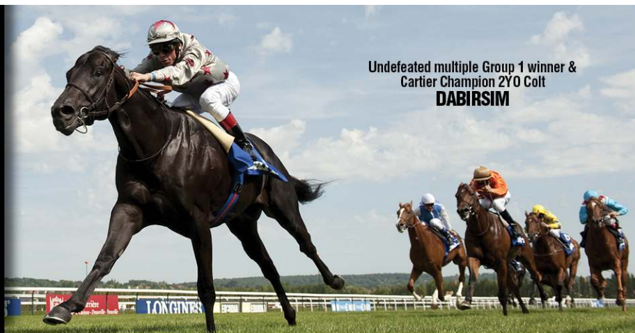
Undeafated multiple Group 1 winner & Cartier Champion 2YO Colt DABIRSIM