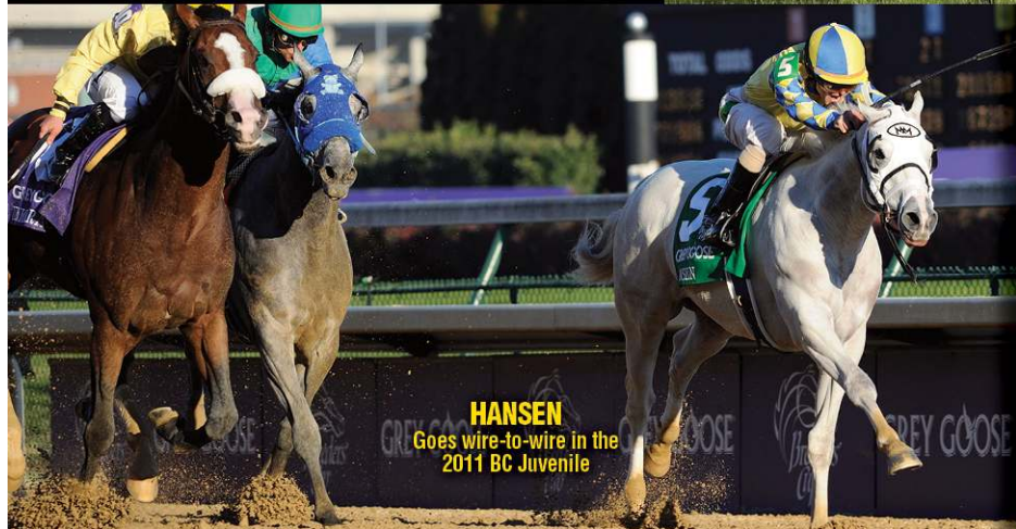
HANSEN Goes wire-to-wire in the 2011 BC Juvenile

TAPIT'S SON, HANSEN, LEADING CONTENDER FOR CHAMPION 2YO COLT IN U.S.