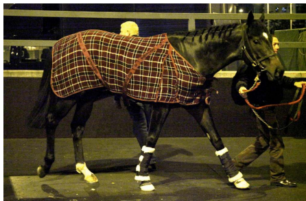
Bated Breath arrives in Hong Kong