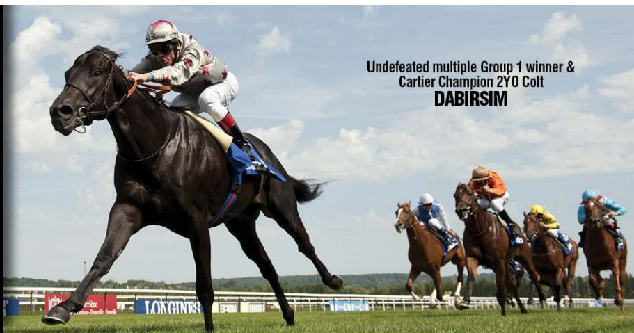
Undefeated multiple Group 1 winner & Cartier Champion 2YO Colt DABIRSIM