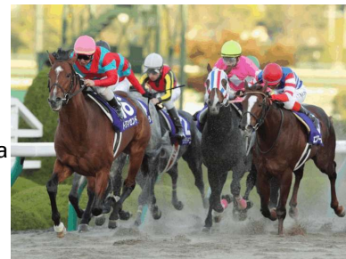
Transcend (Jpn) (pink cap)

put in a strong rail run in the lane, tired just a bit late under Yutaka Take and finished fourth. The judges appeared to take a look at the run into the first turn, as Transcend's path forced at least one rival to take up, but ultimately the result stood. Trainer Takayuki