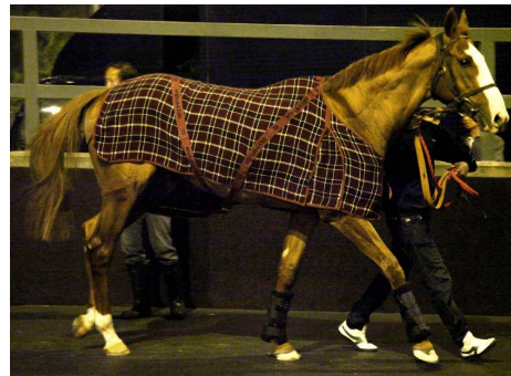
Cityscape Hong Kong Jockey Club photo

The 4-year-old Bated Breath certainly deserves a top-level success after a series of tough-luck defeats this year. He ran second, beaten a half-length, to Dream Ahead (Diktat {GB}) in the G1 Darley July Cup at Newmarket, was just nosed out by that rival in the G1 Sprint Cup at Haydock in early September, and most recently was just a neck back of subsequent Breeders' Cup Turf Sprint winner Regally Ready (More Than Ready) in the G1 Nearctic S. at Woodbine Oct. 16.