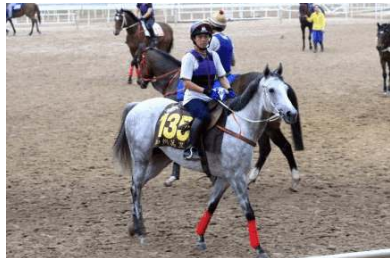
California Memory

The home team will be well-represented in the Cup, with reigning Hong Kong Horse of the Year Ambitious Dragon (NZ) (Pins {Aus}) and California Memory (Highest Honor {Fr}) the leading chances. The latter has