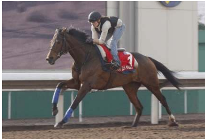
Cirrus des Aigles

Cirrus des Aigles (Fr) (Even Top {Ire}) was perhaps past his peak when he finished seventh behind Snow Fairy at 45-1 from a high draw in last year's G1 Hong Kong Cup. The price will be much, much lower this time when the 5-year-old, the top-rated runner at the meeting according to the international rankings, takes his shot this year. The gelding will be making a remarkable 11th trip to the post in 2011 and has been nothing short of sensational, with five victories including a last-out upset of So You Think (NZ) (High Chaparral {Ire}) in the G1 Qipco Champions S.