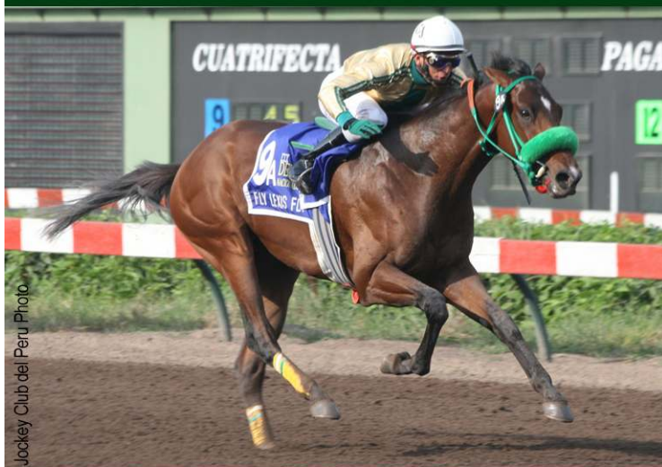
Jockey Club del Peru Photo