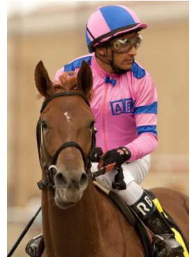
Weemissfrankie