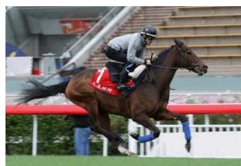
Cirrus des Aigles

Cirrus des Aigles (Fr) (Even Top {Ire}), who will vie for G1 Hong Kong Cup favoritism, got to stretch his legs through the Sha Tin stretch yesterday morning, and by all accounts, the 5-year-old knows raceday is near.