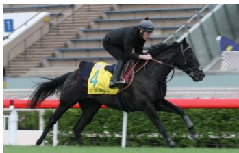
Society Rock