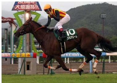
Epice Arome

With two wins in three starts, including a first group tally in the G3 Kokura Nisai S. in her latest Sept. 4, Epice Arome (Jpn) (Daiwa Major {Jpn}) has been made the tepid 3-1