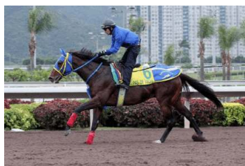
Pas de Trois