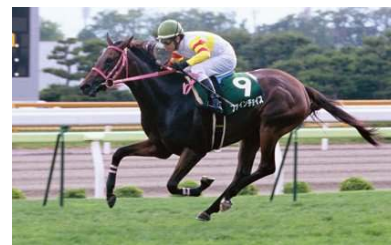
Fine Choice