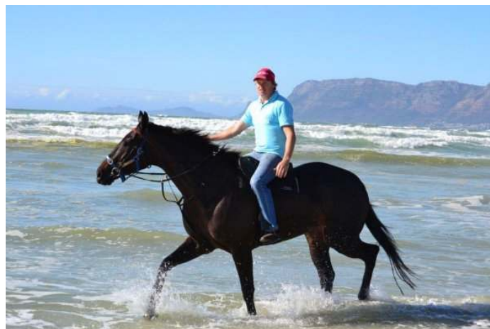
Ebony Flyer in action