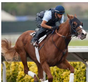
Majestic City