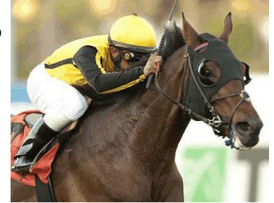
Sanagas