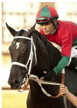
Ultimate Eagle

Ultimate Eagle heads into Monday's GII Sir Beaufort S. as the one to beat after four straight victories since equipped with blinkers and switched to turf, including wins in the GI Hollywood Derby Nov. 27 and GII Oak Tree Derby at Santa Anita Oct. 7. The 3-year-old has big-time speed from the gate and will likely have to use it from his outside post. Ultimate Eagle spots his rivals five pounds. Mr.